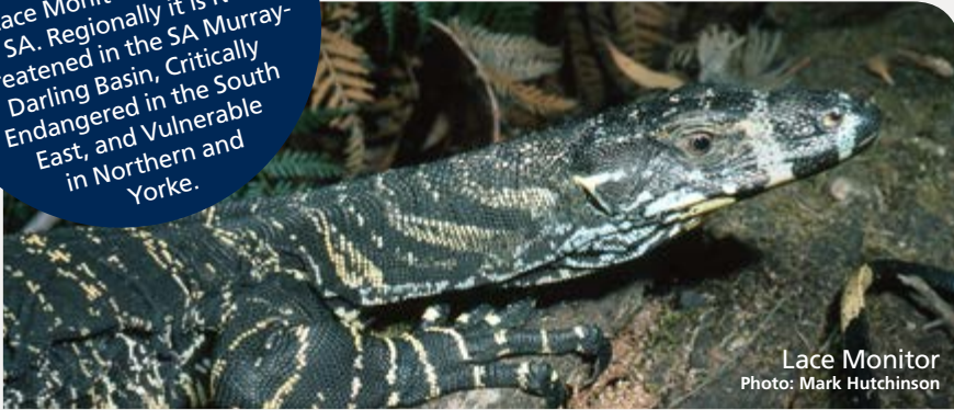
Lace Monitor

Lace Monitors are Rare in SA. Regionally it is Near Threatened in the SA Murray-Darling Basin, Critically Endangered in the South East, and Vulnerable in Northern and Yorke.