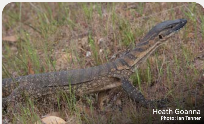
Heath Goanna

If you find a dead Heath Goanna on the mainland, please take it to your nearest natural resources centre where it can be passed on to the South Australian Museum for use in future research.