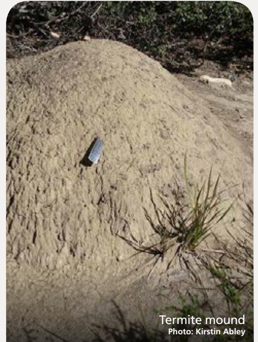
Termite mound

Large patches of native vegetation with healthy termite mounds are essential to the survival of Heath Goannas.