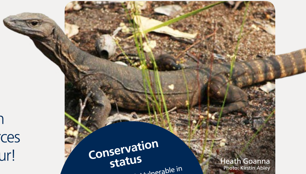
Heath Goanna

Goannas are predominately terrestrial predators that are at their most active during the day. They assist in pest control by taking rabbits, mice and rats. They also feed on carrion, small birds, other mammals, insects, spiders, small reptiles and eggs.