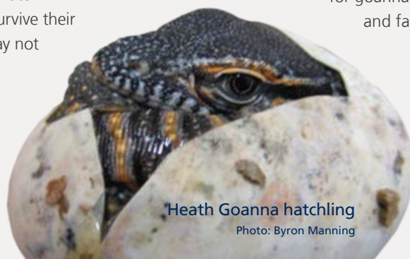
Heath Goanna hatchling